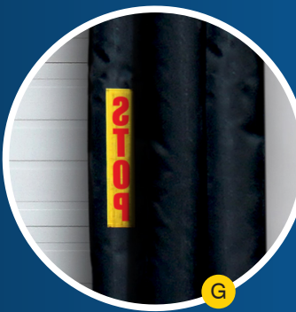
High visibility reverse 'STOP" logo